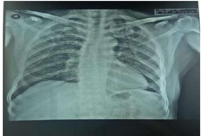
Figure 2. The PA chest X-ray at Wangaya Hospital. Fibroinfiltrates were seen in both lung fields and a minimal left pleural effusion also can be seen.

The results of histopathological examination of prostate tissue showed granulomatous features with caseous necrosis and multinucleated giant cells ( Langhan's type ), suggesting prostate tuberculosis.